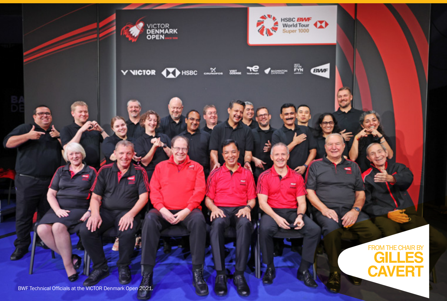
BWF Technical Officials at the VICTOR Denmark Open 2021.