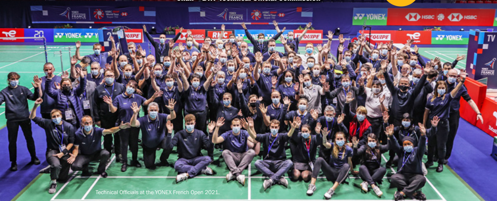
Technical Officials at the YONEX French Open 2021.