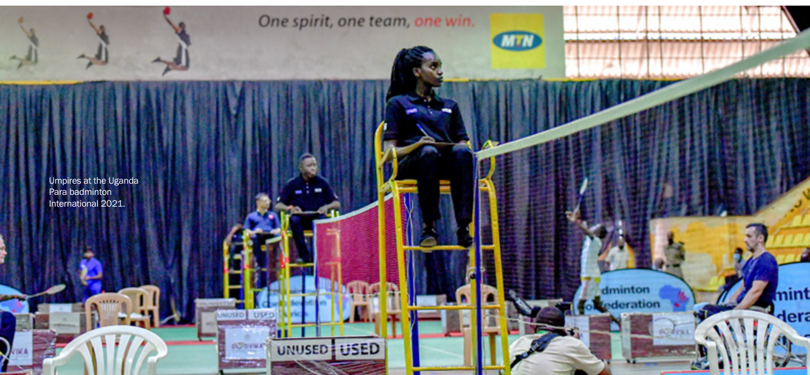
Umpires at the Uganda Para badminton International 2021.