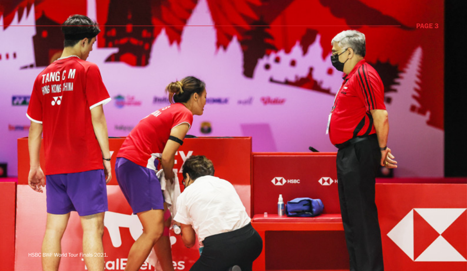
HSBC BWF World Tour Finals 2021.