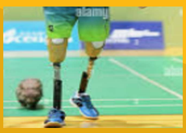
(African player BWF webpage - Other examples of different disabilities)